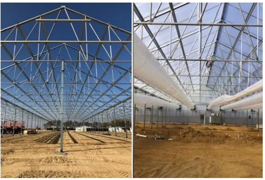
Quite a difference. Left is the greenhouse being built, on the right side the tubes are installed creating the over pressure. Remarkable is the position of the tubes, providing a climate suited for the citrus farm.